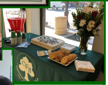
PHIL'S RETIREMENT PARTY!